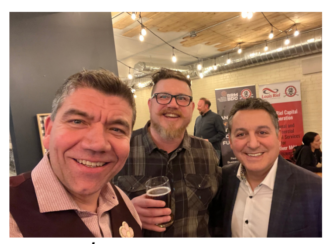
January 10/25 - Obselete Brew Pub, Dauphin

The PNPN is part of the outreach from Public Services and Procurement Canada (PSPC) to disburse information on procurement opportunities and resources. I joined the Network last Fall and have recently become the co-chair of the PNPN. We meet every two months to get updates on key opportunities, success stories and initiatives related to procurement across the Prairie region. We will also learn about upcoming workshops, resources and best practices from the other members of the network so stay tuned as I will be sharing news that is relevant to the RRMBA.